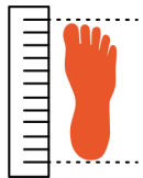
01. GET A RULER

Please keep in mind that leather stretches. The measurements in the chart indicate the shoe's inner length, same as the last used to manufacture your shoe. If you don't want to measure your feet, we recommend choosing a size or a half size smaller, as our sizes run big and leather stretches over time.