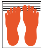
02. MEASURE BOTH FEET ON THE RULER