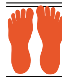
03. PICK THE LONGEST FOOT