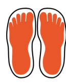
04. CHOOSE YOUR SIZE